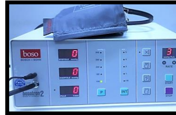
Blood pressure monitors